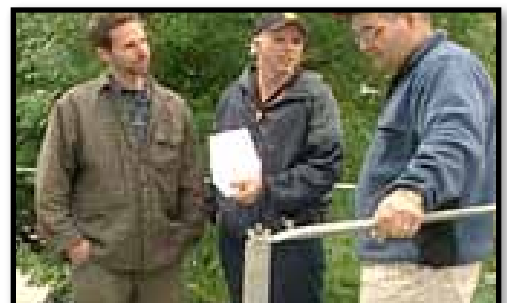
I. Might as well cap it off with a few more.