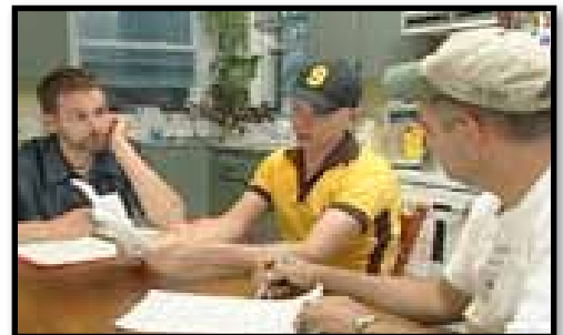
F. Write, discuss, agree and sign.