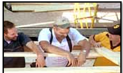
G. Don't hesitate to ask questions.