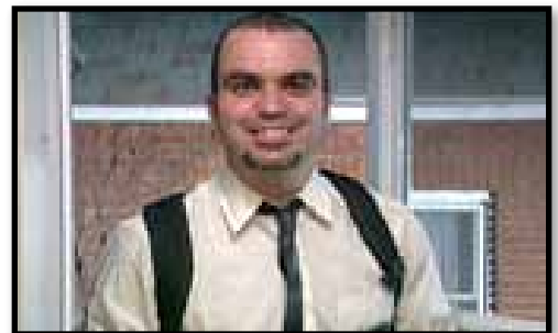
D. Door to door? Not your friend.