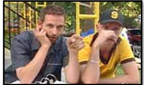
E. Conducting an interview.

Before giving your final payment, check over the work to ensure it is done to your satisfaction.