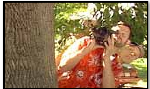
C. On the hunt for a contractor.