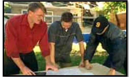
A. Checking out the architectural plans.