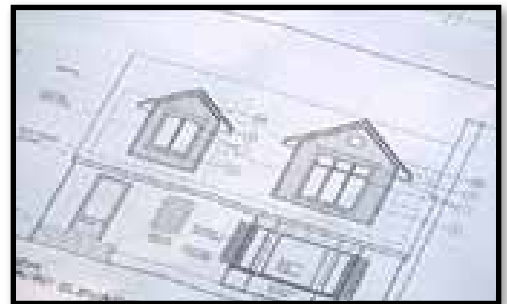
B. Detailed plans are a must!