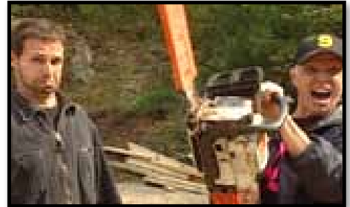
F. Not a toy.