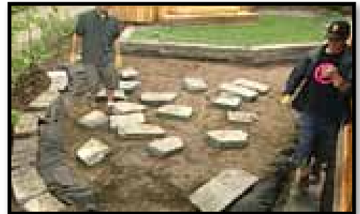
C. Laying stones around the edge.

Lay the sod as soon as it's delivered Water the lawn for 12 to 14 days, for a minimum of an hour per day