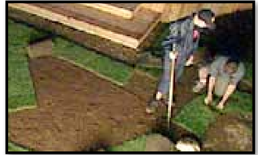
B. Laying sod around the edges first.