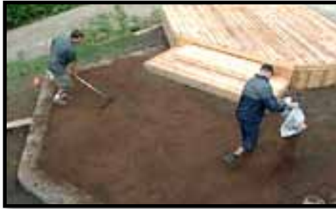
A. Preparing the yard.