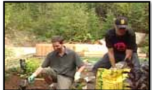
E. Planting the plants.