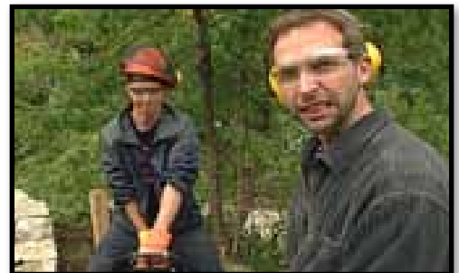
G. It might be time to call in a pro!