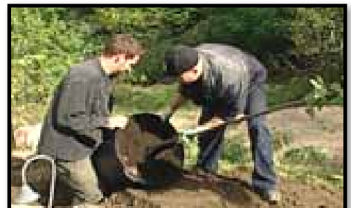
H. Transferring the tree to the hole.