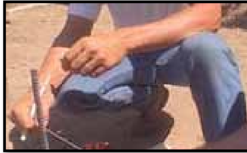
F. Set the grade.