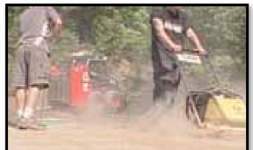
M. Compact the stones to set the sand.