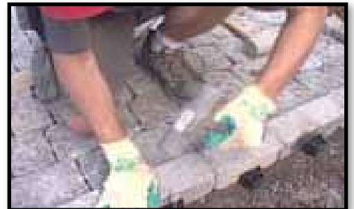
K. Installing and edge restraint.