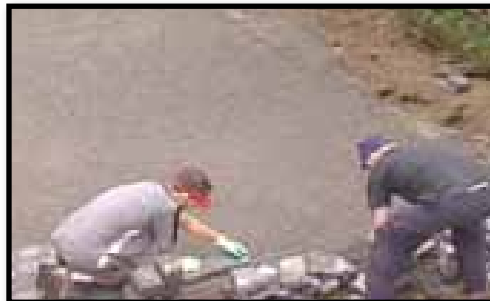
J. Lay the stone into the dust.