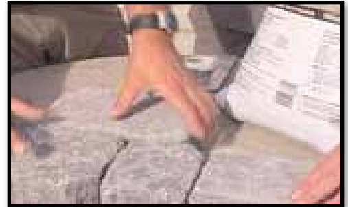
A. Paver products are varied.