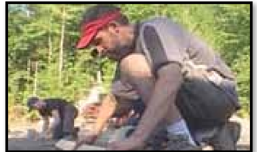
I. Stone dust and 2x4 for levelling