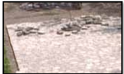
B. Pavers are more durable..