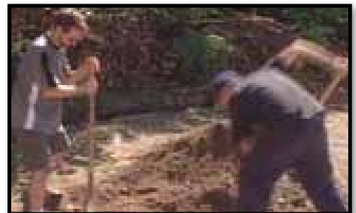
D. A great deal of digging!