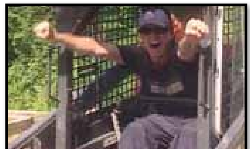
E. The wild bobcat.