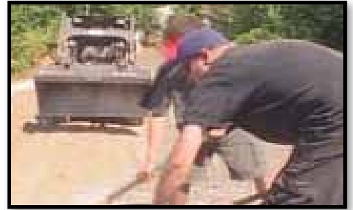
G. Fill with gravel.