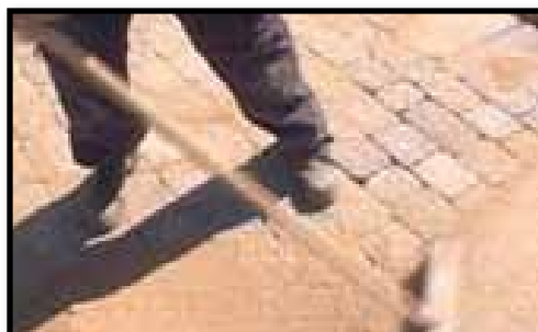
L. Add stabilizing sand on top.