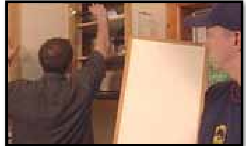
A. Remove cupboard doors.