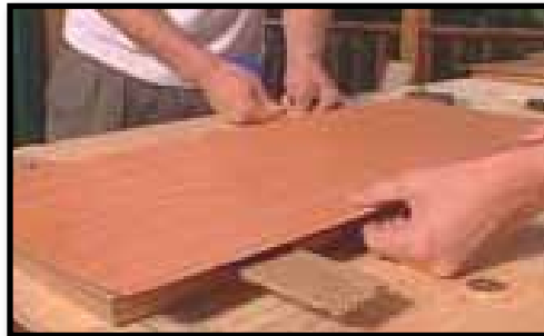
F. Attach laminate to cupboard doors.