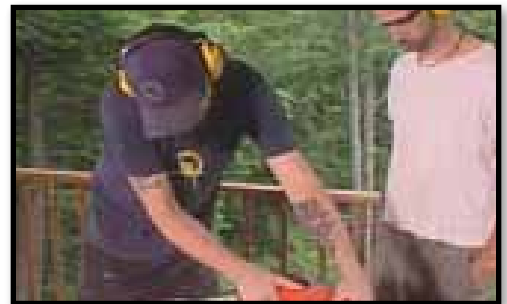
B. Rough up the surface.