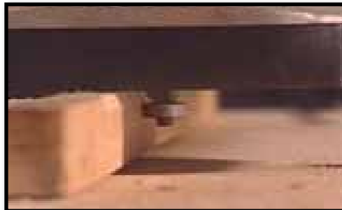
H. The router on an edge.