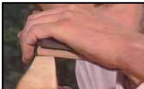
J. Final edge sanding.