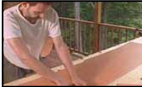
D. Score the laminate.