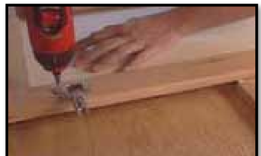
K. Attach hardware to doors.