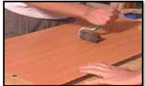
G. Use a roller to smooth out bubbles.