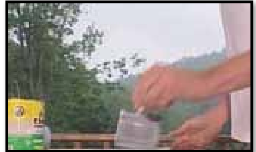
E. Apply contact cement.