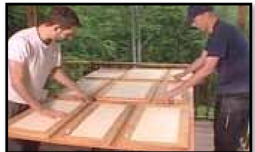
C. Layout the doors.